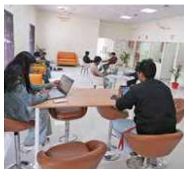
Co-working space at the Noida Campus